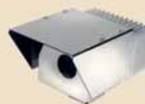
Cam Cool II